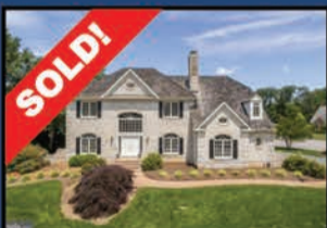
9390 Warburton Ct | $1,200,000