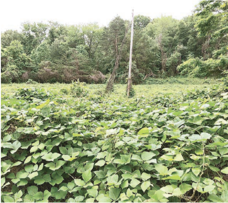
Kudzu, 'the plant that ate the South,' can form vast blankets of vines crossing meadows pushing out any other native plants and climbing into and suffocating trees. Shown here in Laurel Hill Park before chemical treatment killed the Kudzu and allowed planting native trees to restore the area to forest.