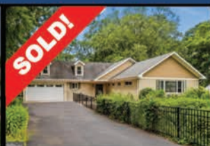
4325 Tarpon Ln | $950,000