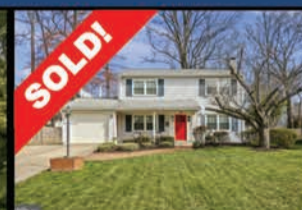
2210 Londonderry Rd | $900,000