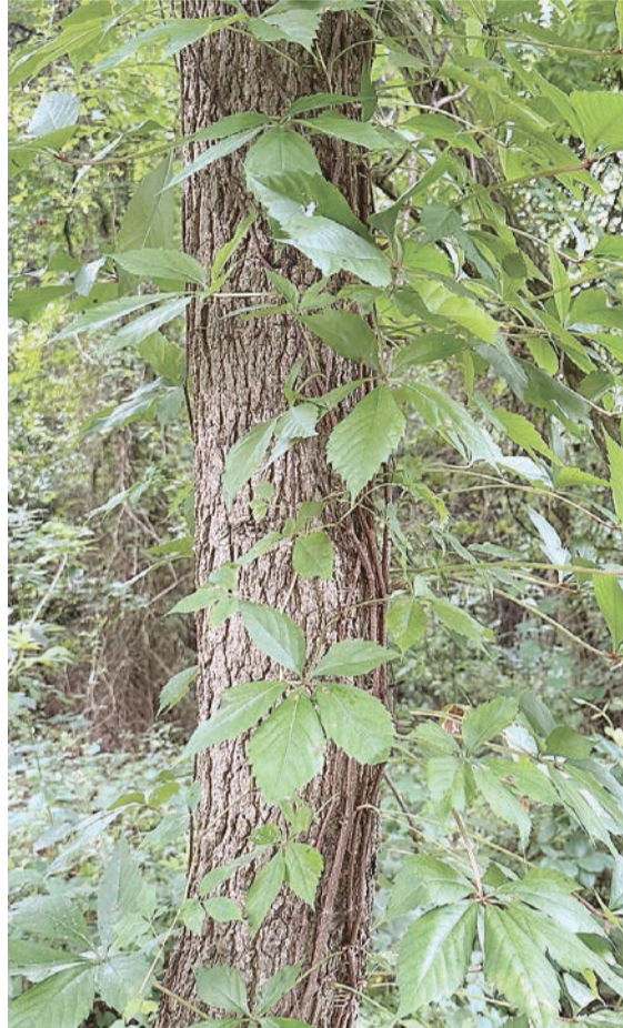
Not all vines are tree killers, such as this native Virginia Creeper, whose lighter weight and compact habit are not as great a strain on its host, and in turn is a host to other native wildlife.