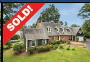
5210 Burke Dr | $877,000