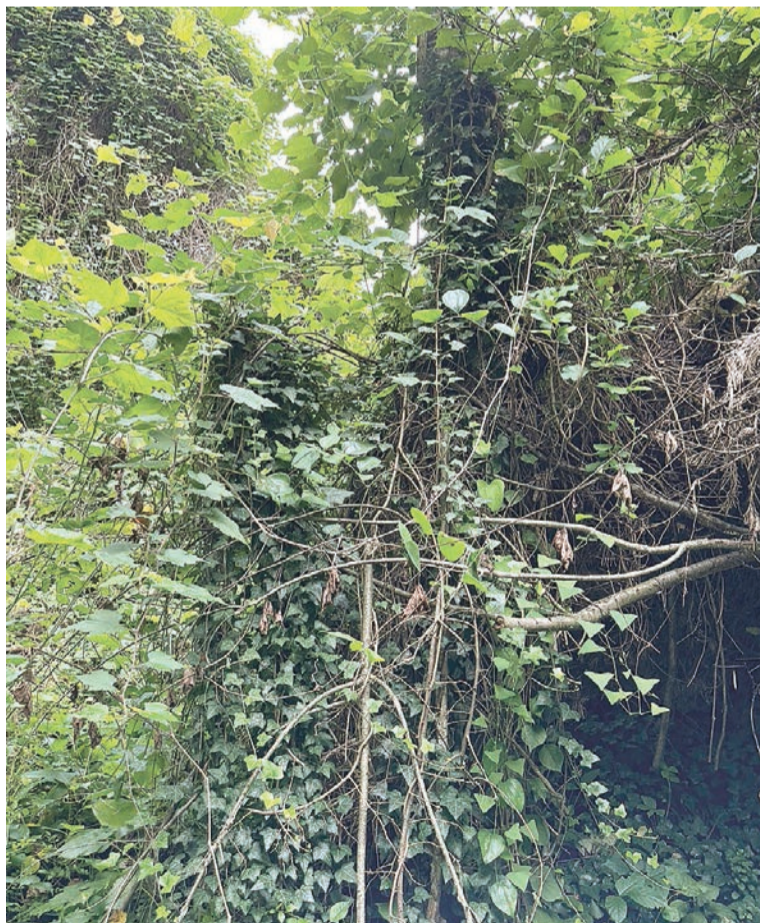
This mature tree likely succumbed to the weight of English ivy stealing nutrients and to Porcelainberry in its canopy denying sunlight to its leaves.