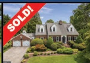
1112 Cedar Dale Ln | $1,220,000