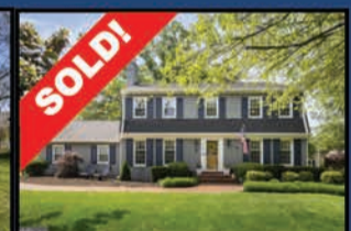
3600 Riverwood Rd | $1,150,000

41 homes sold in 2023 so far! 703.283.9028