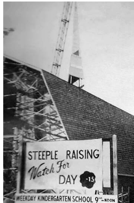
Countdown to the steeple raising, Aldersgate UMC in 1964.