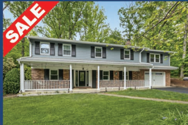
4108 Old Mill Rd | $749,000