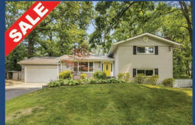
4008 Old Mill Rd | $835,000