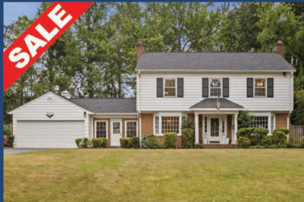
4413 Neptune Dr | $999,000

Why do your neighbors overwhelmingly select the Chris White Family team? Read over 100 five star reviews on Zillow from your neighbors detailing their experience working with us