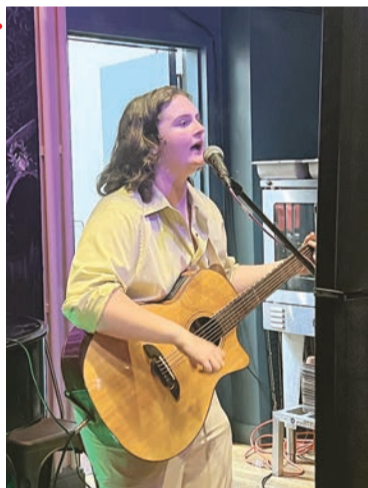
Mary-O’s in New York City.