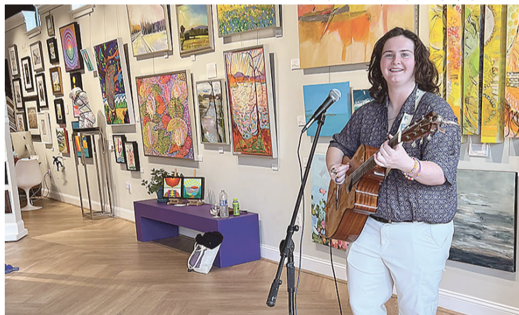
On some Thursdays, the Nepenthe Gallery in Hollin Hills has local musicians as guests at their open houses.