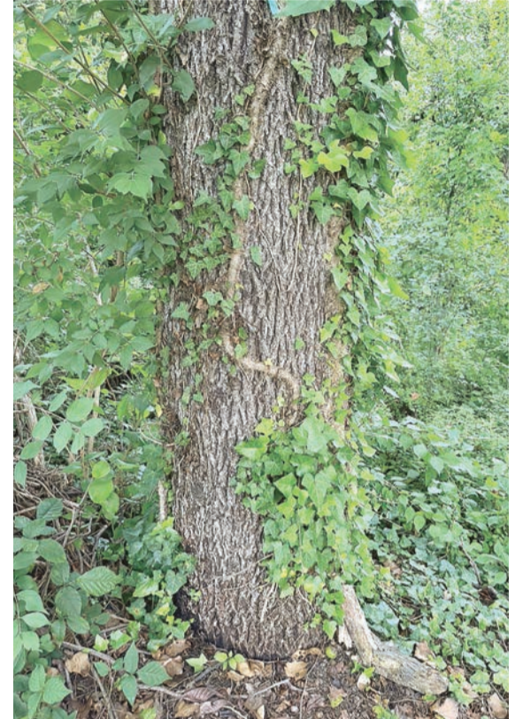
Last Fall volunteers cut invasive English Ivy vines at ground level and in a window pane pattern to help save this tree at serious risk with vines covering about 80 percent of the trunk. This season, though fewer shoots, the ivy is adding growth, trying to come back. Without use of chemical sprays, cutting must be repeated to weaken the unwanted plants over time.